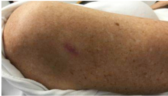
Fig 2. Healed posterior upper deltoid donor site.

The donor site on the upper deltoid is marked and anesthetized. A flexible disposable blade is coated with petrolatum, and graft excision is performed using delicate, side-to-side movements. The flexible blade allows precise control of the diameter, thickness, and beveled peripheral graft edge. The size of this donor tissue should be approximately 10% larger than the defect to account for normal tissue contraction. The graft is then gently trimmed and secured in the defect with interrupted 6.0 nylon sutures. Several 2-mm slits are placed in the graft to allow for exudative drainage, and a bolster is applied (Fig 1, B ). This surgical technique illustrates the benefits of the posterior upper arm as a donor site, ease of use, quick healing, and excellent cosmesis (Fig 1, C ).