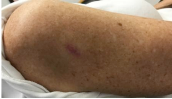
Fig 2. Healed posterior upper deltoid donor site.

The donor site on the upper deltoid is marked and anesthetized. A flexible disposable blade is coated with petrolatum, and graft excision is performed using delicate, side-to-side movements. The flexible blade allows precise control of the diameter, thickness, and beveled peripheral graft edge. The size of this donor tissue should be approximately 10% larger than the defect to account for normal tissue contraction. The graft is then gently trimmed and secured in the defect with interrupted 6.0 nylon sutures. Several 2-mm slits are placed in the graft to allow for exudative drainage, and a bolster is applied (Fig 1, B). This surgical technique illustrates the benefits of the posterior upper arm as a donor site, ease of use, quick healing, and excellent cosmesis (Fig 1, C).